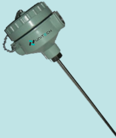
WEATHERPROOF TEMPERATURE SENSOR